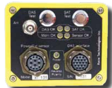
XI-100 Control Panel

Iridium Satellite LLC is the only provider of truly global voice and data solutions with complete coverage of the earth, including oceans and polar regions. The Iridium Constellation of 66 low-earth orbit (LEO), cross-linked satellites, operates as a fully meshed network and is the largest commercial satellite constellation in the world. The Iridium service is ideally suited to real-time maritime emergency applications such as free-drifting subsurface data collection platforms at sea.