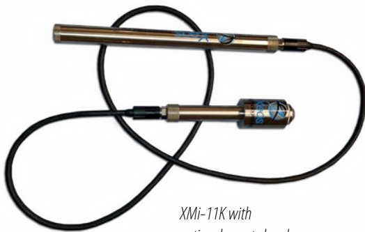
XMi-11K with optional remote head